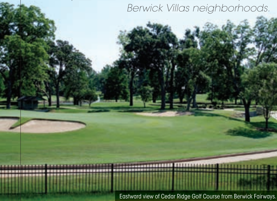
Eastward view of Cedar Ridge Golf Course from Berwick Fairways.

Berwick on Cedar Ridge, one of Tulsa's premier master-planned communities, invites you to tour the new Berwick Fairways and Berwick Villas neighborhoods.