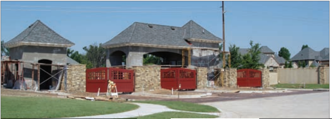
Interior view of Berwick Fairways gated entry under construction.