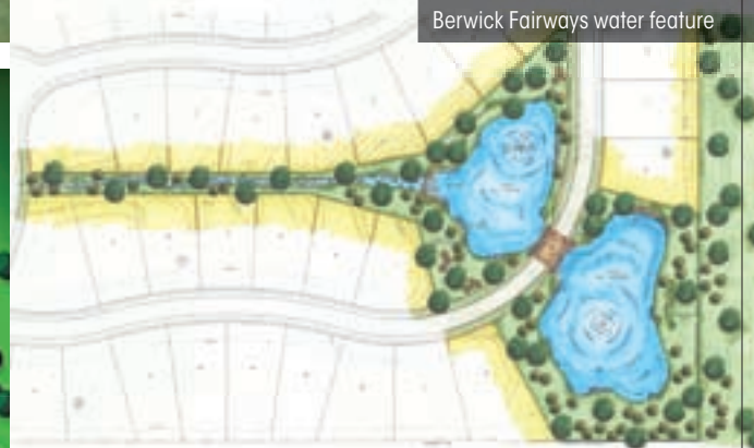
Berwick Fairways water feature